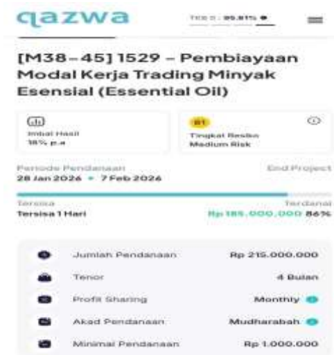
Figure 2. Detailed Information on MSME Financing Based on the Mudharabah Agreement on the Qazwa Sharia Fintech Platform